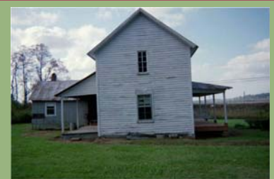
Back porch before restoration