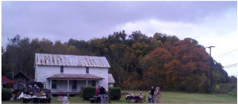
Crisp air and fall colors provide a backdrop for the Matt Gardner Homestead Museum Folklife Festival