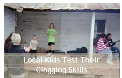
Local Kids Test Their Clogging Skills