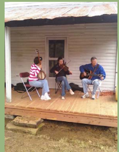
The new cedar porch looks great!

To make a tax deductible donation...visit www.mattgardnerhomestead.com